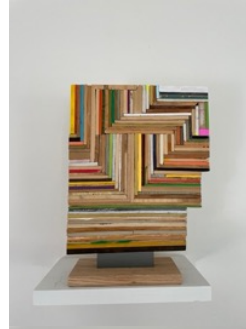
Stacks , 2016-2021 mixed media, wood, glue 11 x 8 x 3 in. $2,000