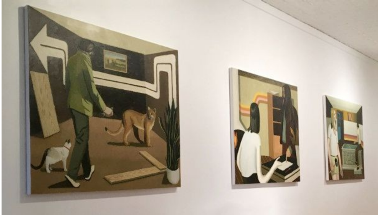
Work by Greg Burak

The treatment of media by each painter further complements this reading of their work. Burak's closed shapes lead away from specificity of form, reinforcing the dream-like quality of his vignettes, and push forward the role of the viewer. Preston takes the opposite approach and rather than broadly apply paint, he chooses to dive into excruciating details that testify to the veracity of his imagery. The resultant work from both artists pushes expectations of contemporary realism. In their work, moments of truth are presented then defied and authenticity prevails despite lapses from reality.