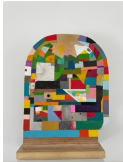
The ragman , 2021 various paints, wood, glue 14 x 10 x 3 in. $2,500