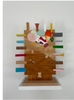
Some of the things I've always wanted to say to you , 2021 mixed media, wood, glue 14 x 11 x 3.5 in. $2,000