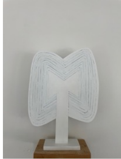
i'll be your mirror , 2021 various paints, wood, glue 15 x 10.5 x 2.5 in. $2,000