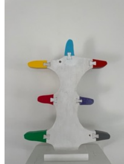
performer , 2021 various paints, wood, glue 14 x 10 x 2.5 in. $2,000