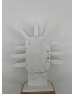
Crown , 2021 various paints, wood, glue 16 x 13 x 3.5 in. $2,000