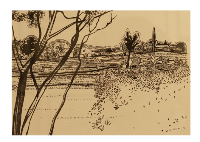
Intimate Line Drawings of Life in a Tiny Indian Village